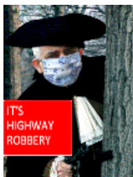
'Don't let them take you for a ride' leaflet (PDF)