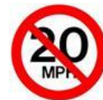
'20mph' in Hammersmith & Fulham is highly objectionable. (Archive)