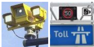
The envy of the world? Plans for England's main roads [2013] (Archive)