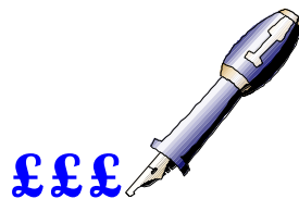
A 'commercialisation' consultation loophole means tolls? [2013]. (Archive)