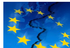
'Euro vision for tolls?' – [ext link, 2013] (Archive)