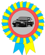
Election 2015: A manifesto for drivers (PDF) (Archive)