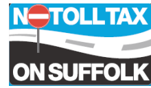
A14 toll – stopped by driver backlash for now, but the threat from ‘Big Brother’ remains... (Archive)