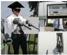
‘Won’t get fuelled again? More pain at the pumps (Archive)