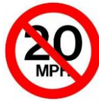
Two-O is Too Slow! Why blanket 20mph zones will not improve road safety and could endanger lives.