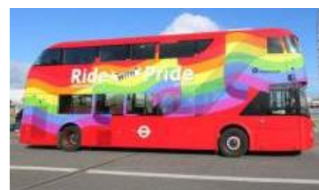
ABD discussion paper on air quality and health (2015)