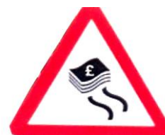
The Infrastructure Act – enabling back door tolls and threats to drivers (Archive)