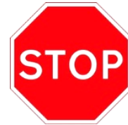
‘The war on the motorist’ continued despite a new government.