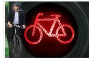
More equal than others? How drivers are losing out from the ideological push for cycling