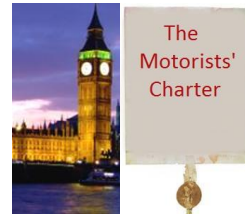
‘A Magna Carta for drivers’ (Archive)