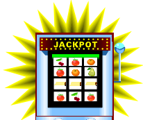
Fixed Penalty Notice consultation– diverting the course of justice? (Archive)