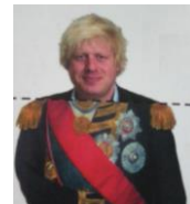
TFL turning the screw on London drivers in Boris’ watch (Archive)