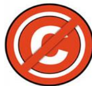
The threat of a Londonwide 'Khangestion Charge' "Can't pay, won't pay!" (Archive)