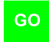
How you can help (plus contact details)