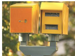
The camera never lies? (interim link).