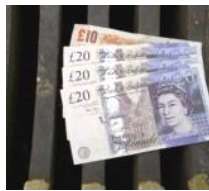
'It's only your money'!! Find out how it's being wasted. (Archive)