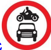
£££ Video and Competition: Does your council give you the Hump? (Archive) £££