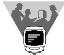
Drivers' poll shows cost and privacy concerns over road pricing moves (Archive)