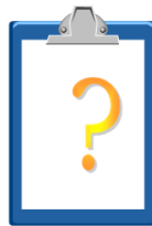
‘Who speaks for drivers?’ (Archive)