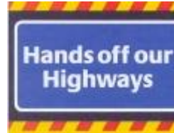
Candidate letters on road pricing - in the 2015 General Election (Archive)