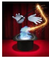
Conjuring up support for '20' in H & F (Archive)