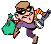
Highway Robbery! Cook’s ‘Independent’ report: fleecing the public [2011] (Archive)