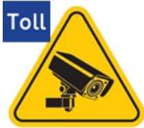
In a hurry? Our summary of points on road pricing plans (Archive)