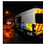
Surprise? Some casualty figures for H & F (Archive)