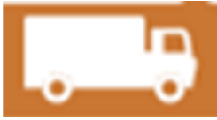
Road pricing for lorries –the pilot, but also a nightmare for the Government? (Archive)