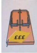
Setting the road pricing trap! Follow-up to the Cook report [2012] (Archive)