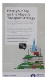
? What had Mayor Khan to hide? (Archive)